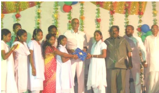
Several students received prizes for top grades

May 1st was graduation day for 40 of the teens from the medical school and Bible school. Reverend