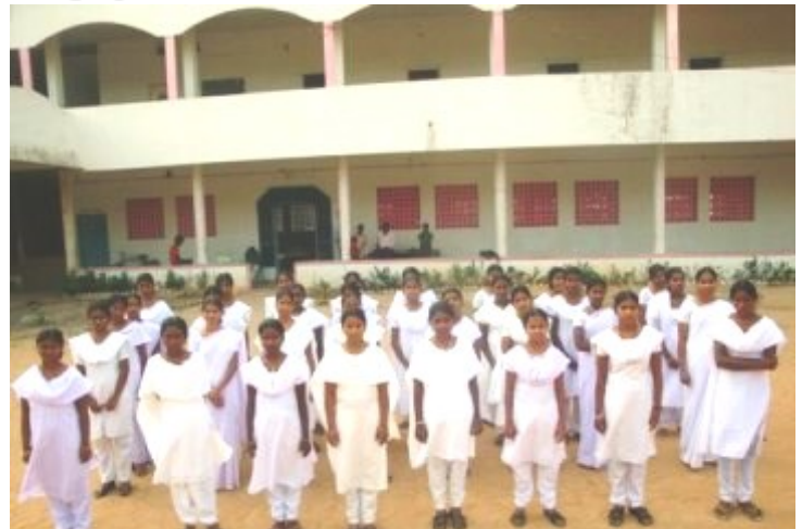
40 teens graduated from medical and Bible school in May