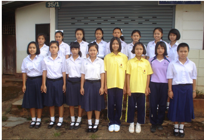
Sixteen girls live at Sameong Girls Home, Thailand

When we last visited, twelve girls were living in the home. We talked to Pastor Wanchai about the possibility of increasing the number of girls they care for. He told us the cost to care for each girl is about 2,000 baht per month which is about $65. They grow some of their own food and the girls help with the cooking, laundry, and other chores. We were blessed to attend Sunday services at the church located on the same property as the