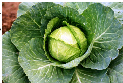
Garden provides delicious vegetables.

Each prayer prayed, visit made, and dollar given has been seed planted in the CCC soil. The growth and difference noticed at CCC from last year was remarkable. The new fence allows the children to feel they have a safe space to roam and play and items are no longer being stolen from the grounds. The shamba (garden) is making good progress. We witnessed neat rows of spinach, kale, cabbage, tomatoes, potatoes and other vegetables. We helped the farmer and children plant onions. The children like to water the crops, plant new seeds, and collect the harvest.