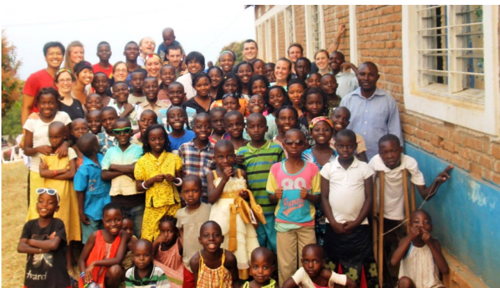
Group photo of NCC team, orphans and CCC staff

We are delighted to share thoughts from members of the National Community Church fourteen member mission team who recently returned from visiting Congo for Christ, Uvira, Congo: