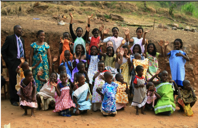
Girls are excited and thankful for new dresses.