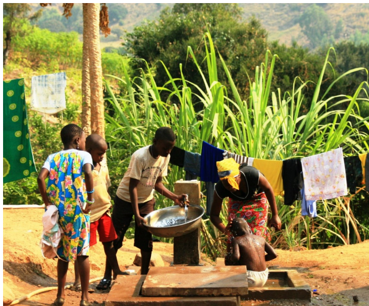
Many of you gave generously to provide water for CCC. You can see the life-giving water is still flowing. Morning bath time.

A wonderful outcome from the fence and the shamba is the noticeable health and growth of many of