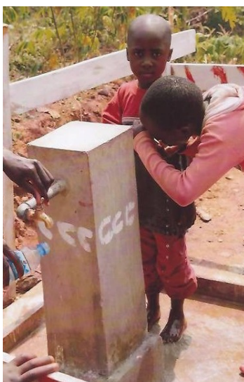
Water for Congo for Christ