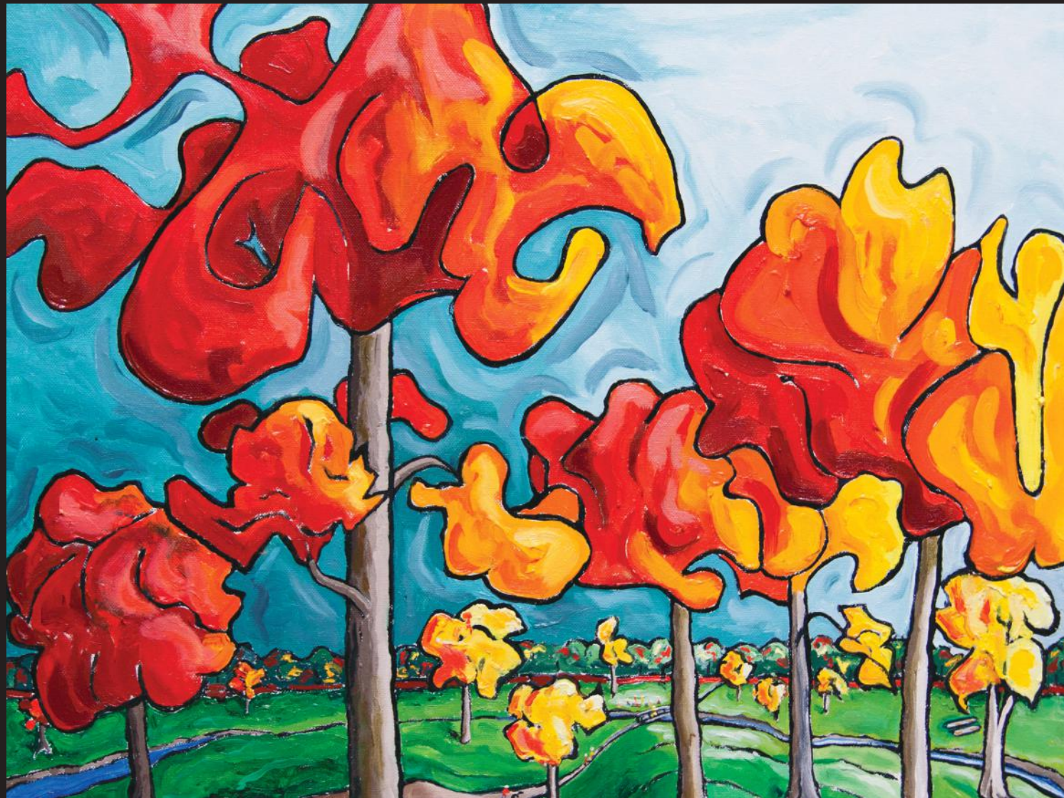
“Fall Picnic” Oil on Canvas 20” x 24”