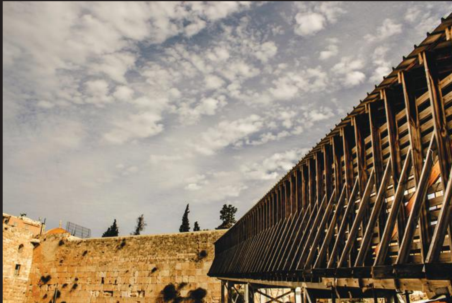
“Golden” Photography 11.52” x 17.28”