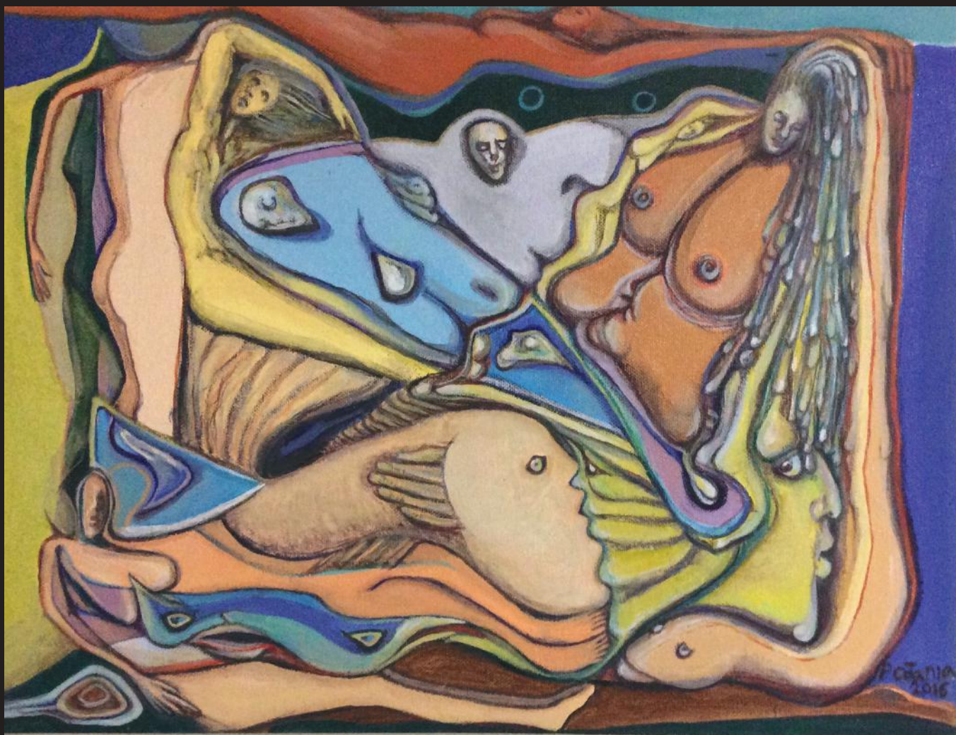
“Pompeii” Oil on Canvas 15.5” x 19.5”