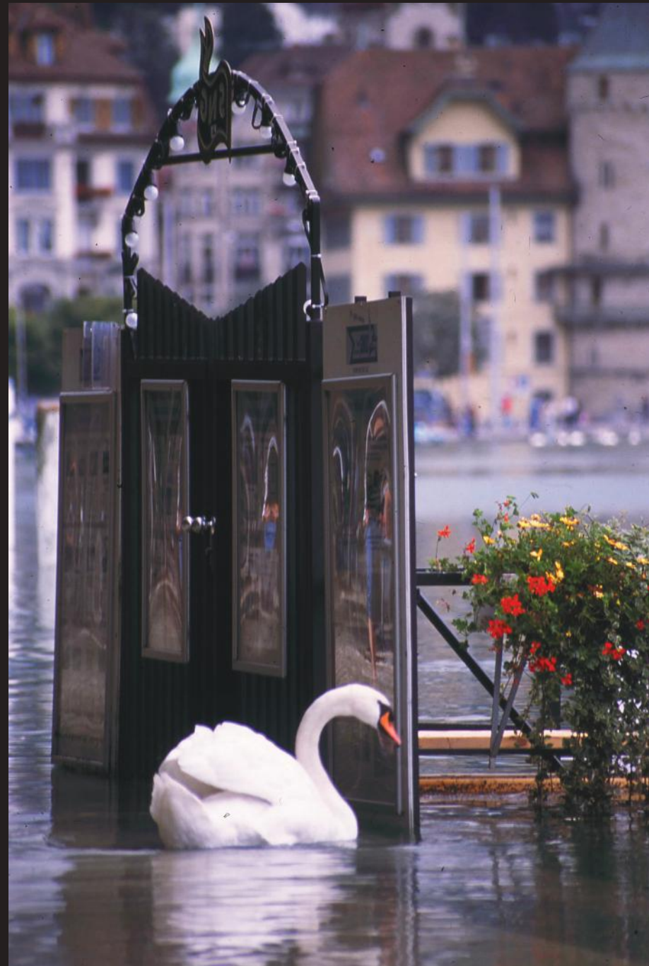
“Swan at the Door” Digital Photography 24” x 16”