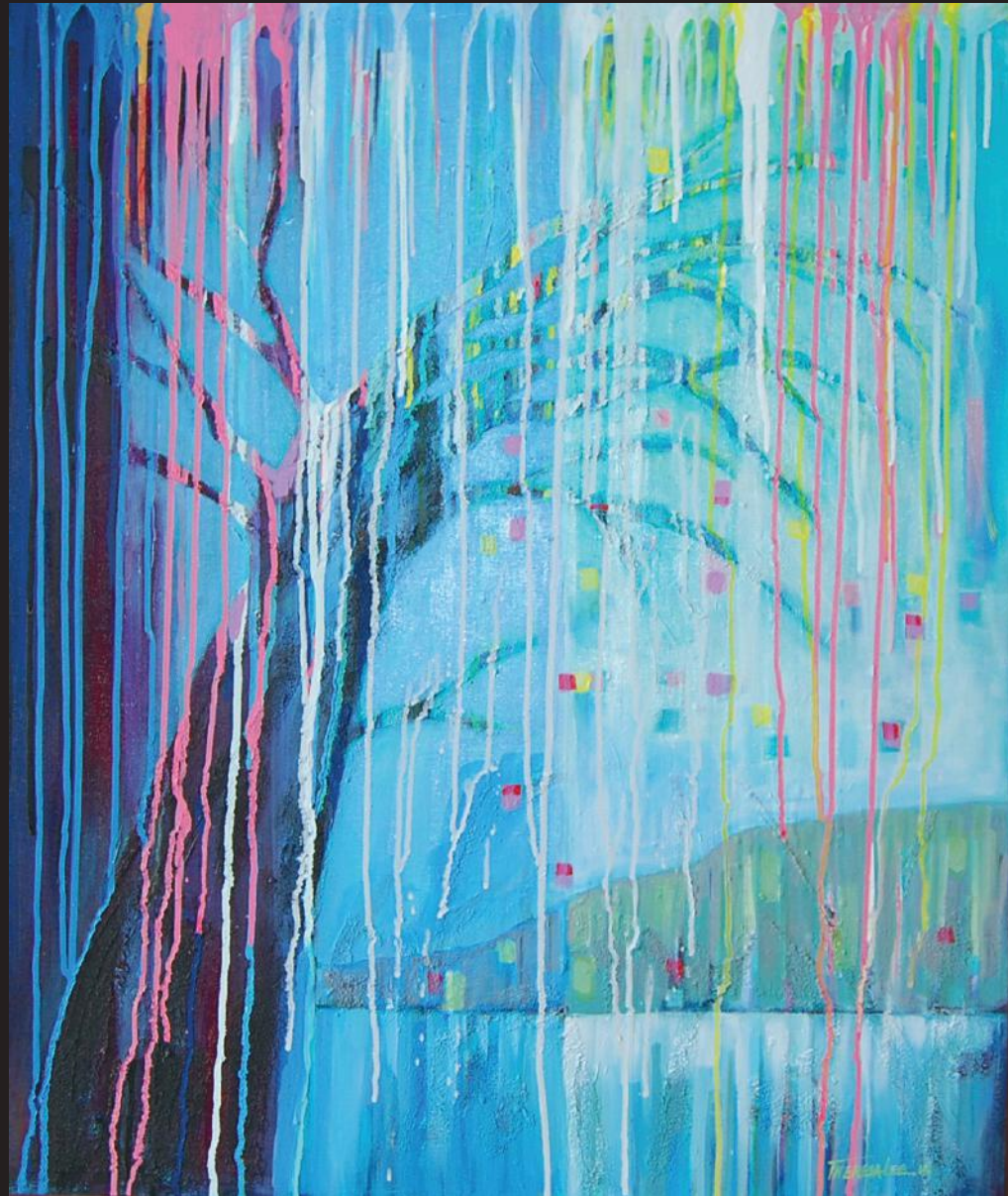
“Spring Rain 1” Acrylic on Canvas 36” x 30”