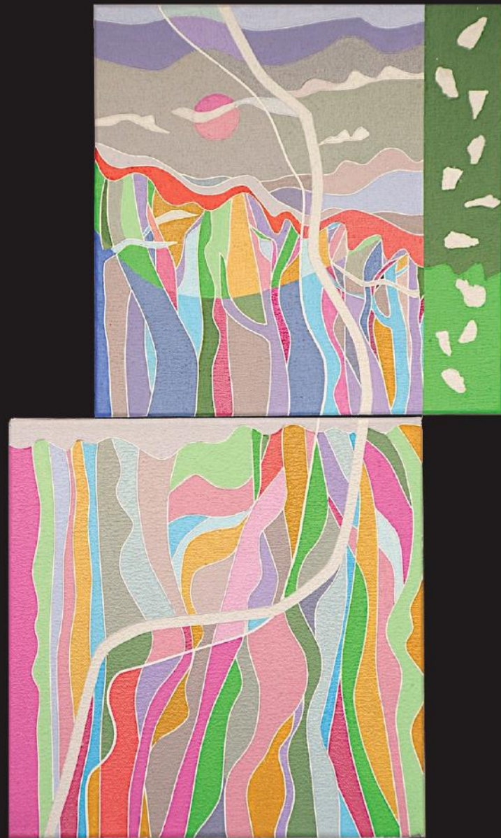
“Dance To The Earth (ffm) Part III” Acrylic on Canvas 20” x 12”