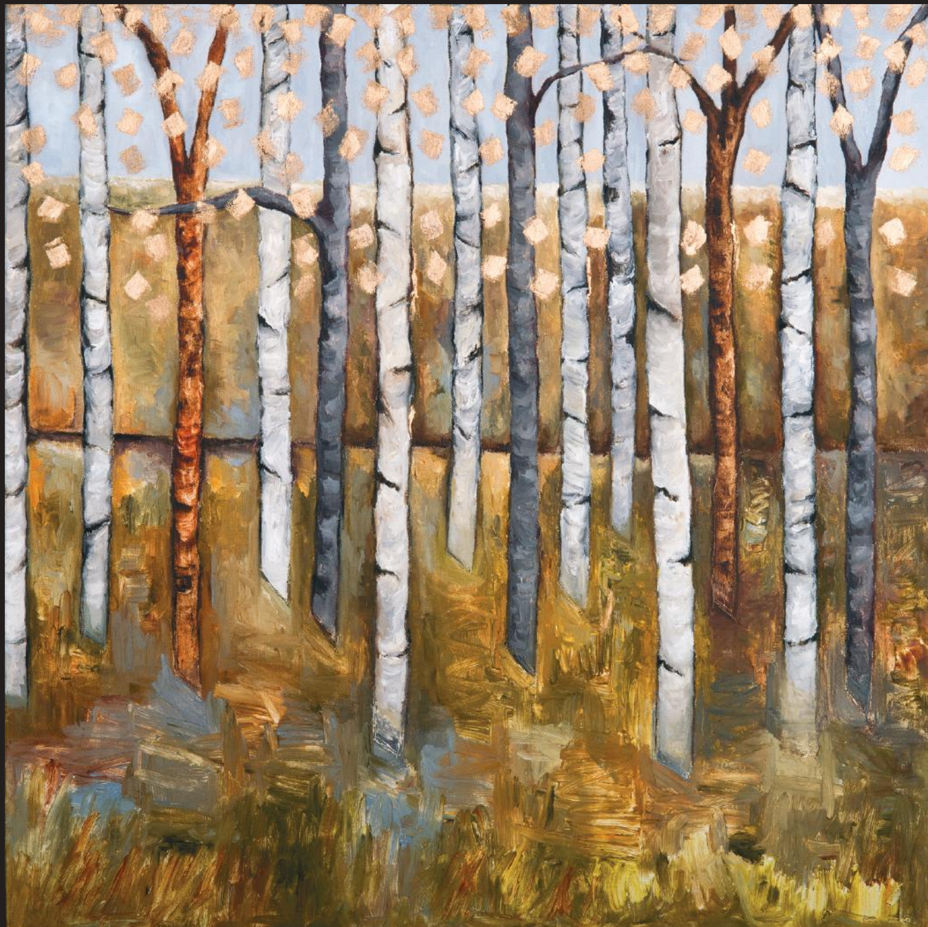
“Brilliance” Oil and Cold Wax on Canvas 30” x 30”