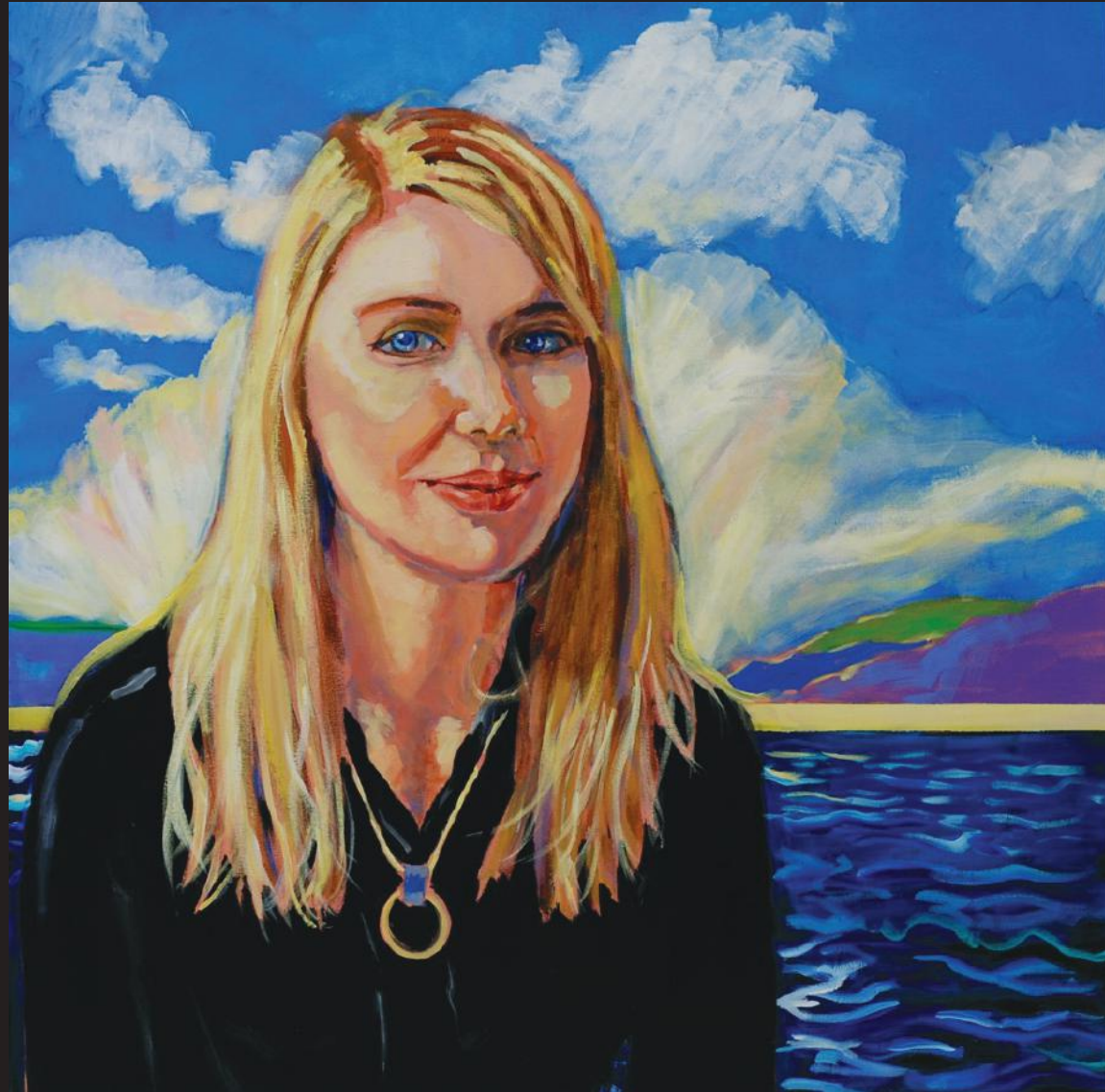
“Wonder Water Image #5”