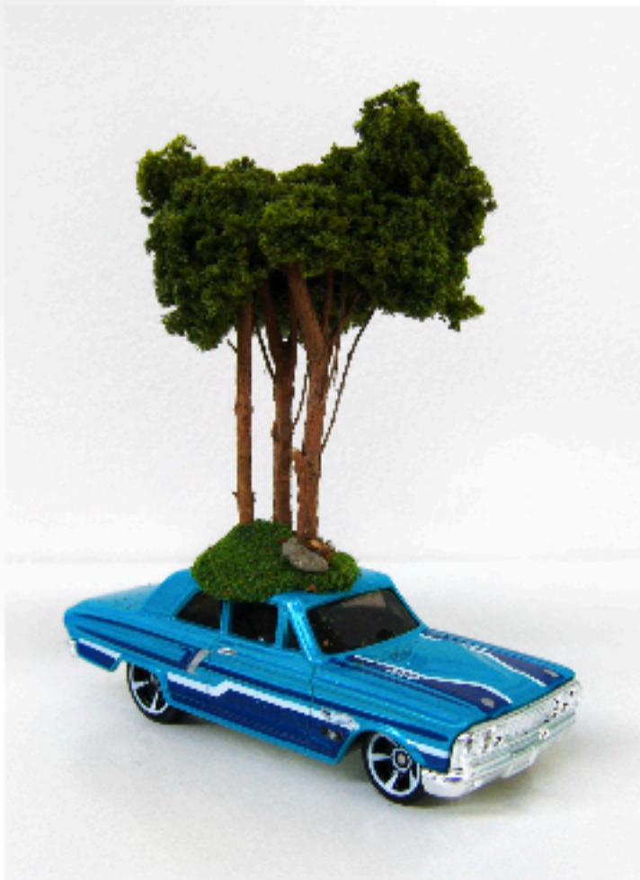
Milyn Nguyen, 'Car 2' 2012, found car, fibre, twigs, 9 x 3 x 7.5cm