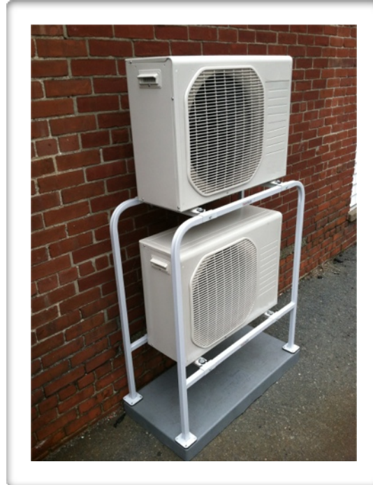
Mini Split QSMS1203 SPECS

Applicable for residential or light commercial installations