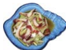
Tako Su $5.95 Octopus & cucumber.