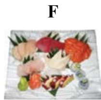
F 7 kind of Sashimi $33.95