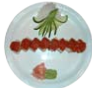
New York Roll $9.95 Spicy salmon, avocado & spicy tuna.