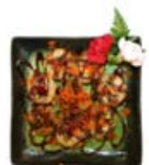
Tornado Roll $9.95 Shrimp tempura, avocado inside, wrapped with fried potato string. Seaweed paper & soy paper.