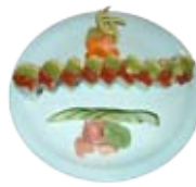
Boston Roll $12.95 eel, avocado, spicy tuna, snow crab & wasabi tobico.