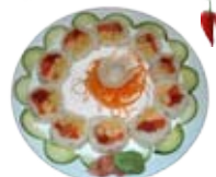
Louisiana Roll $14.95 Spicy tuna, spicy salmon, spicy crawfish, crunch & avocado. (Big Roll)