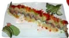
Fantasy Roll $12.95 Shrimp tempura, eel, crunch, pepper tuna, 3 kind of fish eggs.