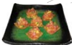
Tar Tar $7.95

Grilled sliced tender beef roll with green onion and carrots.