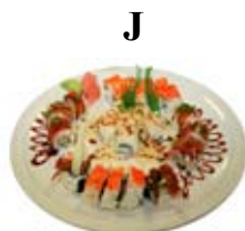
J Deluxe Maki Combo $26.95

California roll, philadelphia roll, spicy tuna roll & japanese vegetable roll.