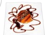
Baked Salmon $5.95 Salmon, snow crab, masago, sesame seeds, baked with eel sauce.