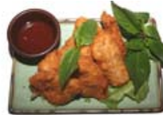
Chicken Katsu $4.95

Robata B (11.95) beef, shrimp scallops, chicken. Robata Beef (9.95), Robata Shrimp (9.95)