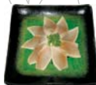
Albocore Tataki $9.95

Tuna, salmon, yellow tail, avocado and spicy mayo.