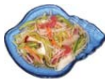
Spicy Seafood Salad $6.50 Mixed fish, crabmeat, cucumber & spicy ponzu sance.