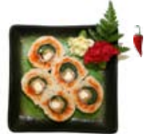
Tiger Eye Roll $8.95 Smoked salmon, cheese & jalapeno. Seaweed paper & soy paper.