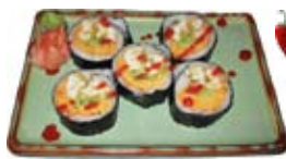
Spicy Calamari Roll $7.95 Calamari tempura, cucumber, snow crab, smelt egg & crunch.