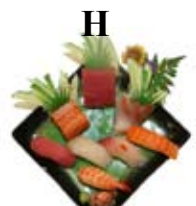
H 3 Sashimi + 5 Sushi $21.95

Sashimi – tuna and salmon Sushi – tuna, yellow tail, shrimp & white fish.