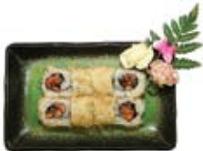
Fried Oyster Roll $7.95 Fried oyster, avocado, snow crab & smelt egg. Soy paper.