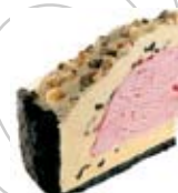
Banana Split $6.95