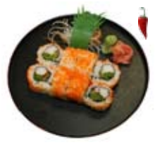
Texas Roll $5.95 Crab meat, cucumber, jalapeno & smelt egg.