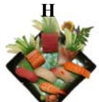
H 3 Sashimi + 5 Sushi $21.95

Sashimi – tuna and salmon Sushi – tuna, yellow tail, shrimp & white fish.