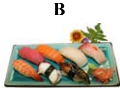
B 7 kind of Sushi $12.50

Tuna, yellow tail, salmon, shrimp & white fish.