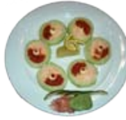
Snow Crab Navado $10.95 Snow crab wrapped with cucumber, Spicy Tuna & Avocado.