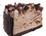
Mississippi Mud $6.95