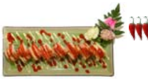
Spicy Crawfish Roll $11.95 Spicy crawfish, crabmeat & spicy sauces.