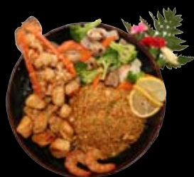
Chicken & Lobster