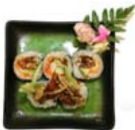
Spider Roll $7.95 Deep fried soft shell crab, cucumber, avocado & smelt egg.