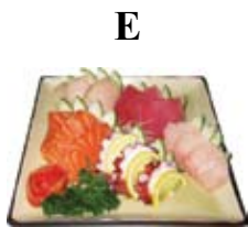
E 5 kind of Sashimi $25.95