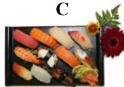
C 11 kind of Sushi $19.45

#B items plus mackerel, squid, surf clam & smoked salmon.