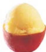
Mango Fruit $6.95