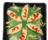
Honey Moon $8.95