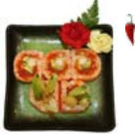
Crazy Roll $9.95 Spicy tuna, shrimp tempura, avocado & cucumber. Soy paper.