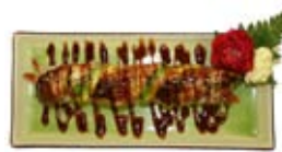
Dragon Roll $10.95 Crab meat, avocado, cucumber & eel.