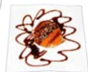
Baked Salmon $5.95 Salmon, snow crab, masago, sesame seeds, baked with eel sauce.