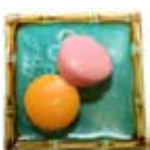
Japanese Mochi Ice Cream $3.50 for two pieces Ask server for flavors