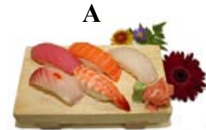
A 5 kind of Sushi $8.95

Tuna, yellow tail, salmon, shrimp & white fish.