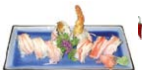
Shogun Roll $11.95 Shrimp tempura, cream cheese, crabmeat & jalapeno.