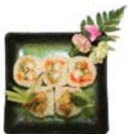
Rock n Roll $7.95 Shrimp tempura, avocado, cucumber & smelt egg. Soybean paper.