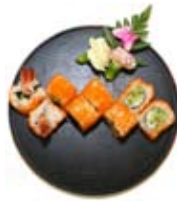
Shrimp Roll $5.95 Shrimp, avocado, cucumber & smelt egg.