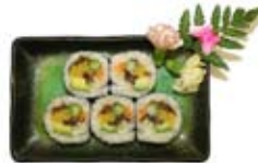
Japanese Veg. Roll $5.95 Asparagus, mushroom, carrot, cucumber & avocado...