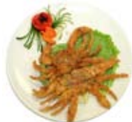
Soft Shell Crab