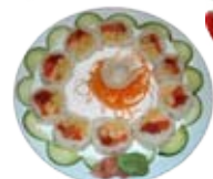
Louisiana Roll $14.95 Spicy tuna, spicy salmon, spicy crawfish, crunch & avocado. (Big Roll)