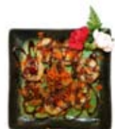
Tornado Roll $9.95 Shrimp tempura, avocado inside, wrapped with fried potato string. Seaweed paper & soy paper.