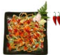
Volcano Roll $9.95 White fish inside. Deep fried with special sauces.