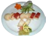
Tuna Box Roll $12.95