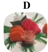
D 3 kind of Sashimi $15.25

#B items plus mackerel, squid, surf clam & smoked salmon.