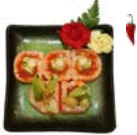
Crazy Roll $9.95 Spicy tuna, shrimp tempura, avocado & cucumber. Soy paper.