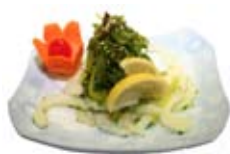
Seaweed Salad $3.95