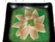
Albocore Tataki $9.95

Tuna, salmon, yellow tail, avocado and spicy mayo.