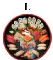
L Shogun Love Boat $59.95

For 2 people. 16 pieces sushi, California roll & spicy tuna roll.