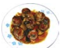
Beef Negima $10.95

Grilled sliced tender beef roll with green onion and carrots.