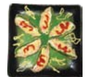
Honey Moon $8.95