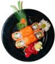
California Roll $4.95 Crab meat, avocado, cucumber & smelt egg.