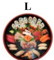
L Shogun Love Boat $59.95

For 2 people. 16 pieces sushi, California roll & spicy tuna roll.