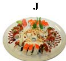
J Deluxe Maki Combo $26.95

California roll, philadelphia roll, spicy tuna roll & japanese vegetable roll.