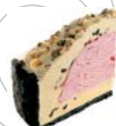
Banana Split $6.95