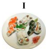
I Maki Combination $19.95

Sashimi – tuna, salmon & white fish Sushi – #g items plus salmon.