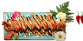
Shaggy Dog $9.95 Shrimp tempura, crab meat, and sesame with Shogun special sauces. (Best Seller)