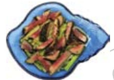
Pepper Tuna Salad $7.95 Pepper tuna & cucumber