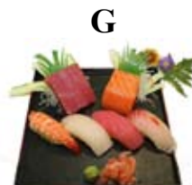
G 2 Sashimi + 4 Sushi $16.95

Sashimi – tuna and salmon Sushi – tuna, yellow tail, shrimp & white fish.