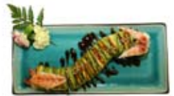
Caterpillar Roll $10.95 Eel, avocado & shrimp decoration.