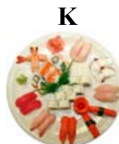
K Kiri Sushi Combo $39.95

Spicy salmon roll, spider roll, tura crunch roll & shaggy dog roll.