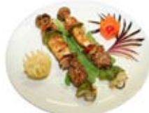
Robata A $10.95