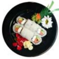
Philadelphia Roll $5.95 Cream cheese, smoked salmon & avocado.