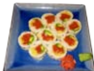
Spicy Boy Roll $12.95 Spicy tuna, crunch, avocado, wasabi, tobico. Soy bean paper.