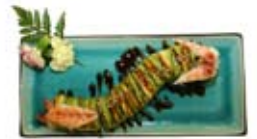
Caterpillar Roll $10.95 Eel, avocado & shrimp decoration.