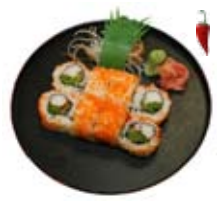
Texas Roll $5.95 Crab meat, cucumber, jalapeno & smelt egg.