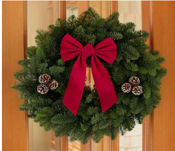
W2 – 22” Noble Fir Wreath - $25.00