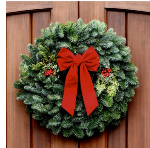
W4 – 22” Mixed Evergreen Wreath - $28.00