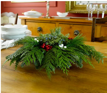
W3 - 28 “ Mixed Evergreen $34