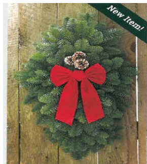
S4 - Noble Fir Door Swag $23.00!