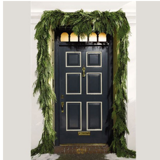
G3 – Western Cedar Garland 10’ - $22.00