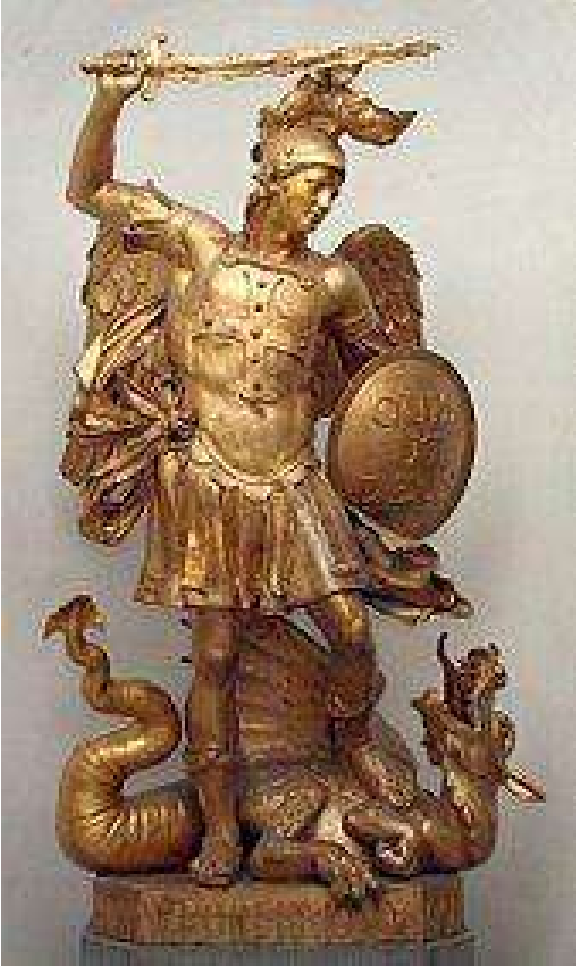
University of Bonn, Germany

judges in such as he gives each person a possibility of insight. It would be better characterized as liberating than judgmental but definitely not condemnation. It is only the unforgiving mind that condemns itself. Archangel Michael never judges anyone in the way that we on earth mean by judging. Michael only brings Light the Light of insight that liberates those who dare to meet it. He brings both living and dead souls out from darkness. He opens the way to Love for those who do not themselves consider that they deserve it. Michael knows that Gods essence is union, total Oneness – Love. His judgment is nothing other than liberation from your own judgment of yourself. Where there is a barrier or resistance Michael comes with the Sword of mercy and cuts through the veils of illusions and breaks chains.