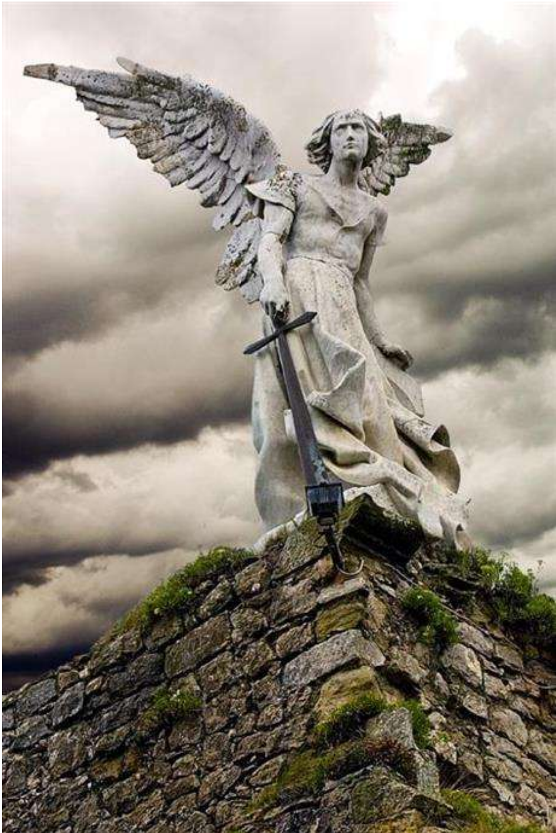
Archangel Michael Warrior of Light