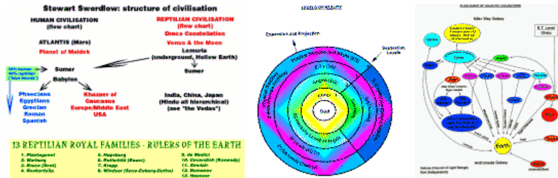
charts and diagrams from Stewarts book "As Ye Sow, So Shall Ye Reap", actual " Blue Blood True Blood "

If this occurs, the effect on the other planets will be devastating.