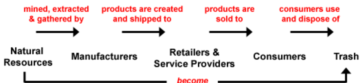
Picture 1. Product life cycle

Products in the Materials Economy follow a life cycle, just as living things in the natural world fulfil a life cycle by which they are born, grow older, and eventually die. The life cycle of any given product observes the following pattern 2 :