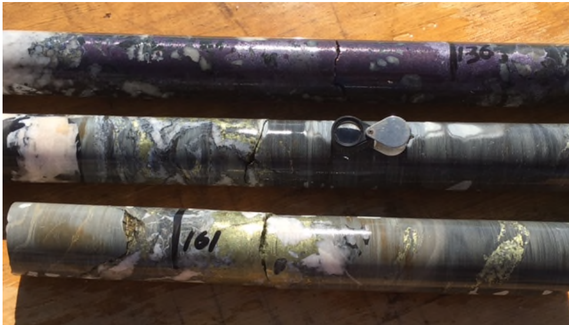
Figure 1: Vein hosted copper sulphides: bornite (top) and chalcopyrite (centre & bottom) in drill core from MO-G-16D. Assays awaited to determine Cu/Ag grades.