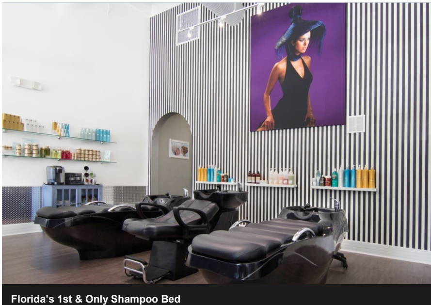
Florida's 1st & Only Shampoo Bed