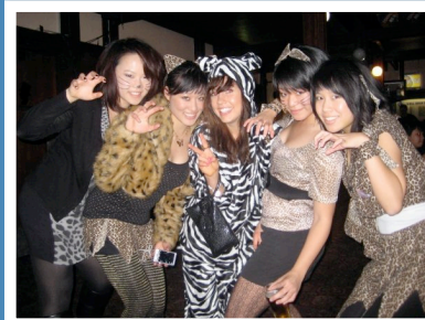
MEET & GREET PERTH 2009