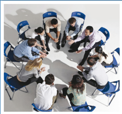
STUDY IN GROUPS