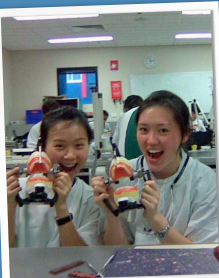
LEARNING NEW SKILLS