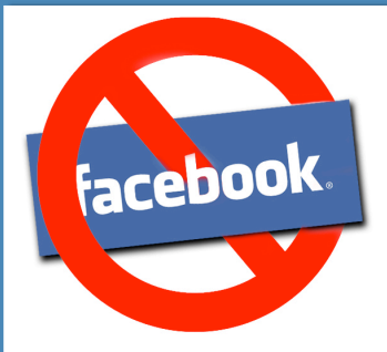
LOSE THE ADDICTION