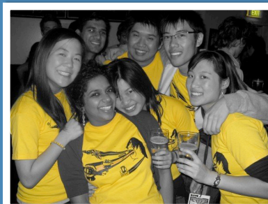
PUB CRAWL ADELAIDE 2007