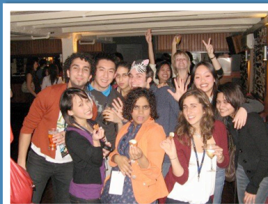
MEET & GREET ADELAIDE 2007

So get involved and remember, you stay classy.