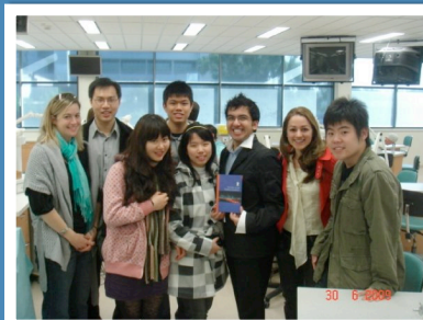
TOUR OF THE WESTERN AUSTRALIAN DENTAL SCHOOL 2009