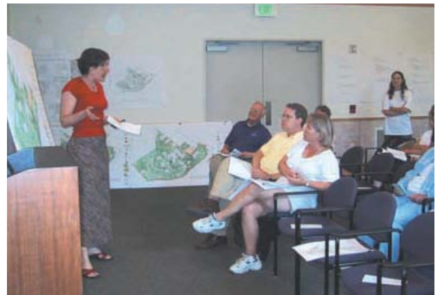
Master planning is participatory, involving workshops with community and staff.