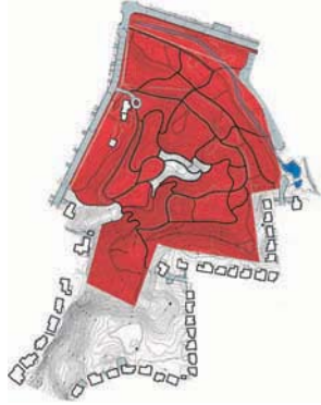
Exotic invasive plants

Cost: $750,000 Status: Master Plan Completed 2002