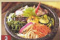
3 "Bibimbop" in Sizzling Stone Pot 들솜비빔밥 ..... 11 Mixed assorted separately sautéed vegetables, rice, egg "juchimg" spicy chili paste sauce in sizzling hot stone pot