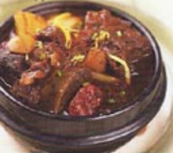
Spicy Braised "Kalbi" Short Ribs