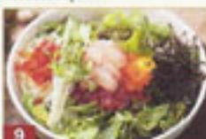
9 "Sashimi" Mixed Rice 회덮밥 ..... 10 Assorted sashimi with rice and fresh vegetable spicy "juchimg" red chili sauce/garnish