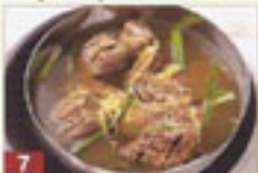
7 "Kalbitang" Beef Short Rib Soup 갈비탕 ..... 9 Slow simmered beef flavored beef short rib and dakkae soup