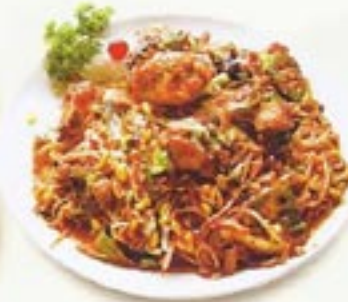
Spicy Braised Mackerel