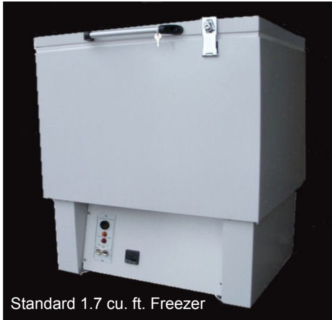
Standard 1.7 cu. ft. Freezer