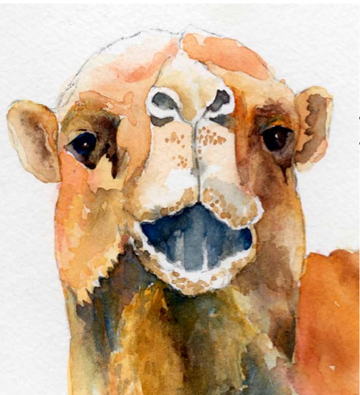
maureen moore, watercolor, 2016

This is your corner to share your ideas. Contact the newsletter with your notices by the 20th of each month for the next issue.