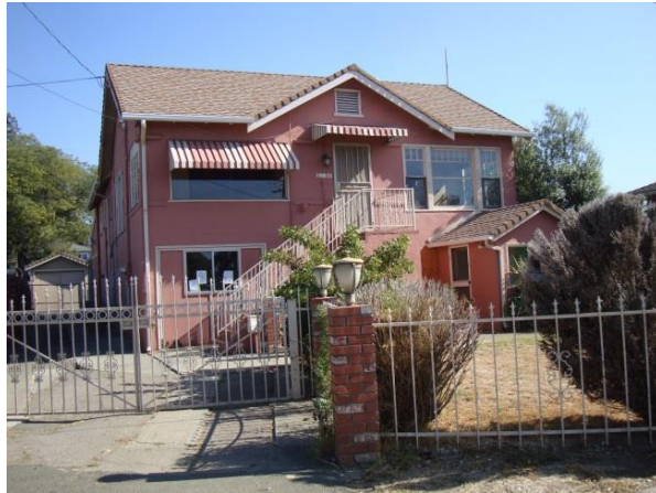
Exterior – After