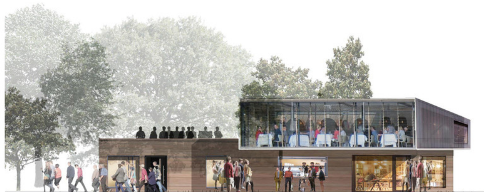
CAFE AND MARINA FACILITIES