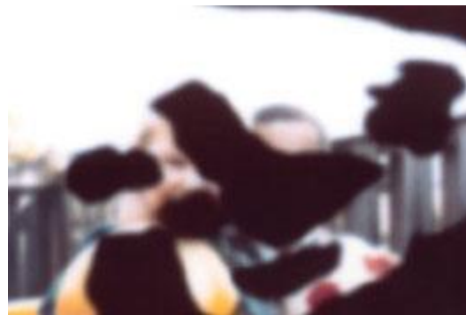
Same scene viewed by a person with diabetic retinopathy