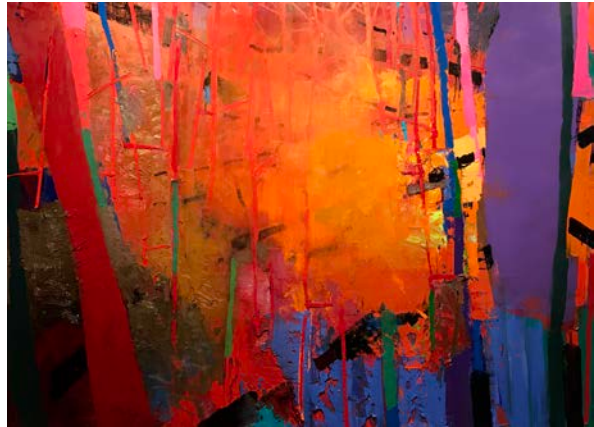
Orion , 2017, Oil on linen, 60 x 82 in