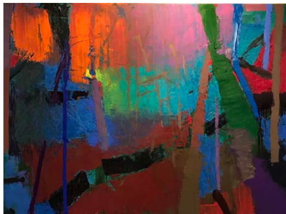
Canyon , 2017, Oil on linen, 48 x 66 in