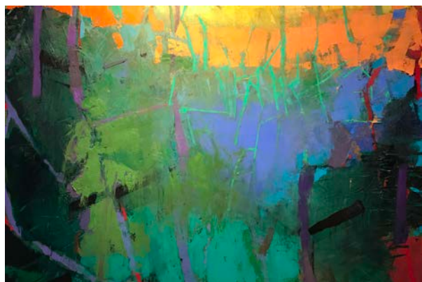
Orchard , 2017, Oil on linen, 52 x 77 in