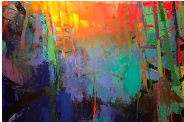
Thicket , 2017, Oil on linen, 52 x 77 in