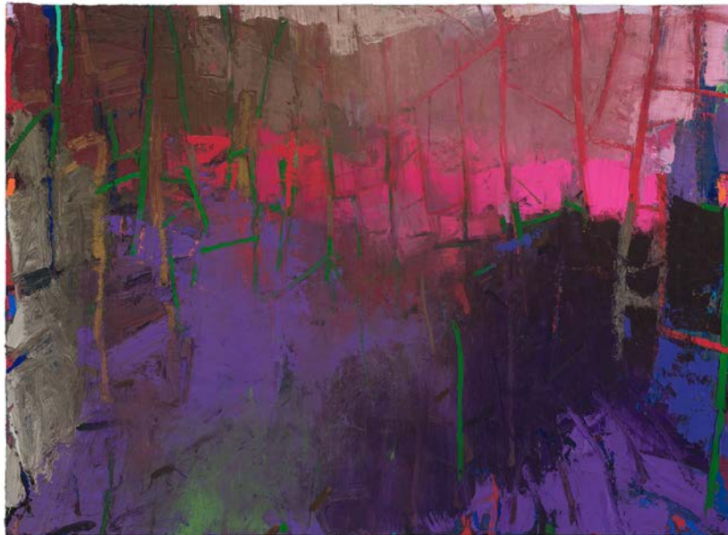
Rattler , 2017, Oil on linen, 48 x 66 in