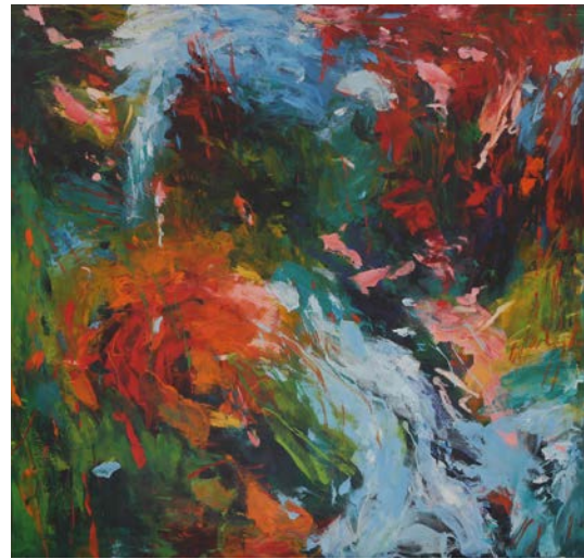
Connally, Changing Places I , 2016, oil on canvas, 50 x 52 in