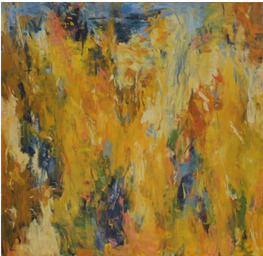
Connally, Time Keeper I , 2016, oil on canvas, 50 x 52 in