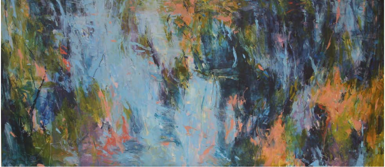
Connally, Spring Flight , 2016, oil on canvas, 42 x 96 in