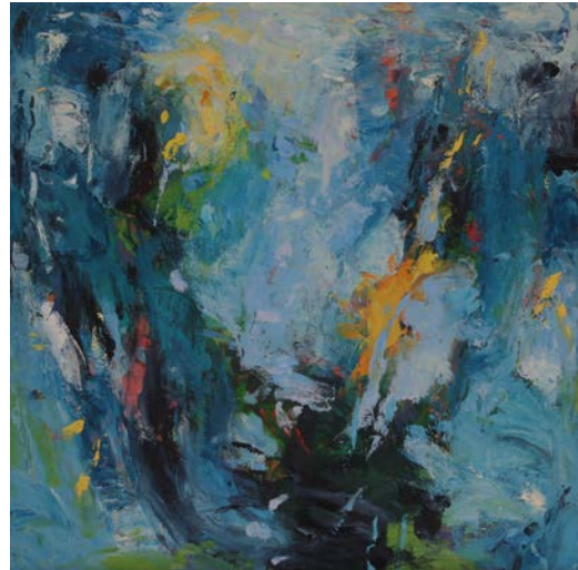
Connally, Water Blue As Air , 2016, oil on canvas, 34 x 34 in