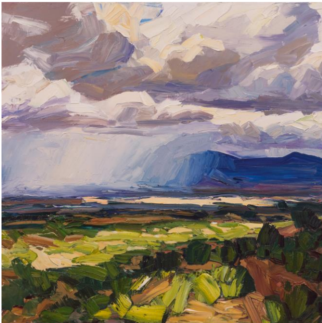
Remnants of a Hurricane , 2015, Oil on Canvas, 40 x 40 in

forms, and shapes in nature that Lee believes inspire the senses and can have a profoundly transformative effect. Leavened only by a disciplined consistency of artistic vision, Lee's remarkable oil paintings on canvas resonate his delight in the midst of the land's beauty.