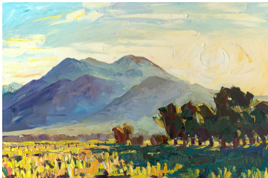
El Prado #2 – Sunrise Over Taos Mountain, 2015, Oil on Canvas, 40 x 60 in