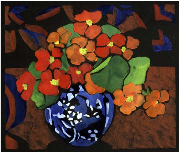
"Nasturtiums" by Annie Day

Notice how the black paper is used to great advantage in the images below. In Margaret Preston's day an artist would have used gouache and card oiled with linseed oil as stencil material, these days we are fortunate to have transparent sheets and acrylic paints to achieve our prints.