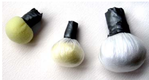
Left to right: Sponge dabber sponge covered in fine foam sheet dacron with foam covering