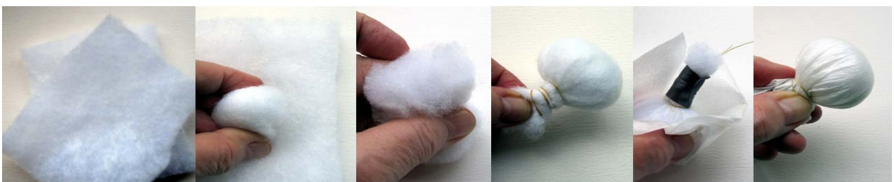
Dacron wadding dabber: made using 2 pieces of dacron, form one into a ball and wrap then cover in fine foam