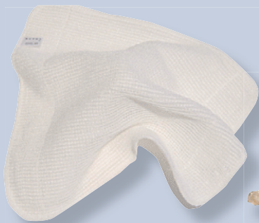
SpaCloth Deluxe (white only)

All of our products are available in three color choices: Yellow/ Green stripes, Pink/Purple stripes, or White. (Except for Deluxe, which is only available in White). The White cloth is made of a tighter weave, allowing for a more astringent exfoliation. It is perfect for people who want a more powerful cloth, however it is not recommended for those with sensitive skin. The Yellow/Green and Pink/Purple striped cloths are gentler, offering a more luxurious exfoliation and perfect for everyone.