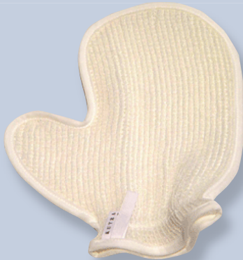
SpaCloth Mitt (white)