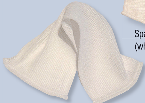
SpaCloth WashCloth (white)