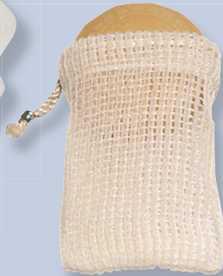
SpaCloth SoapPocket (white)