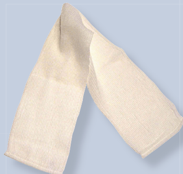
SpaCloth Original (white)