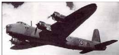
A Stirling bomber

Many Resistance workers had been captured by the Gestapo and were being held in Amiens Prison to await their inevitable fate. On 18th February the RAF launched a low level precise bombing attack intended to blow down the prison walls and allow the prisoners to escape. This was called Operation Jericho, after the biblical story of Joshua and his Israelite army bringing down the walls of Jericho by blowing their trumpets.