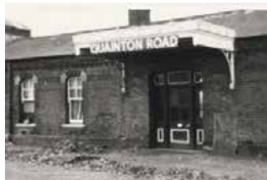
Quainton Road Railway Station