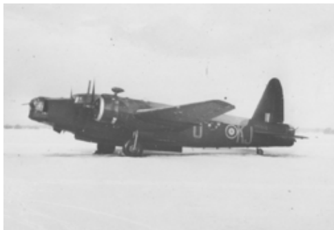
Vickers Wellington Mark X

returning from a mission to the Amiens railway yards in France and was en route to a diversionary airfield when it struck the Wellington from below on the starboard side. The Wellington crashed at 22:35, half a mile east of Quainton Road railway station, and one and a half miles north-east of Westcott, killing all eight crew members. The Stirling, whose crew were on their first mission, crashed at 22.47 at Astwell Park, Wappenham, Northamptonshire killing all on board.