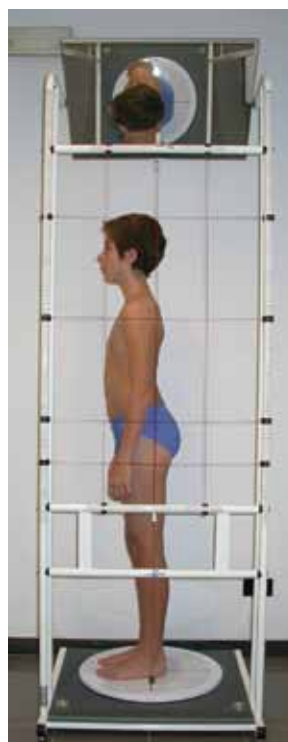
FIG. 1 Postural examination in lateral view: body posture leaning anteriorly with head and shoulders projected forward in relation to the buttocks (front scapulium) and body barycenter moved forward.

The frenectomy or frenotomy is a surgical procedure