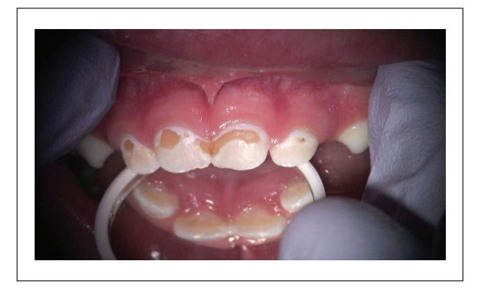
Figure 8. Class | Lip-tie

Figure 7. Severe Decay on Facial Surfaces of an Infant Exclusively Breastfeeding, Nursing on Demand at Night, and Having a Class II-III Lip-tie