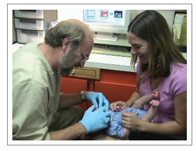
Figure 3. Correct Way to Examine an Infant, Knee to Knee with Parent Controlling Infant Movements

in an effort to maintain some degree of latch. This can cause traumatic injury to the mother's nipples.<sup>10</sup> When the upper lip is tied to the maxillary arch, it may not spontaneously allow for normal breastfeeding.<sup>11</sup> If a mother is experiencing pain and the infant is having problems latching on to the mother's breast, careful observation and examination of the position of the infant's lips on the areola should be performed. Typically, the lips should be 1 to 1.5 inches (2.5-3.8 cm) beyond the base of the nipple.<sup>12</sup>