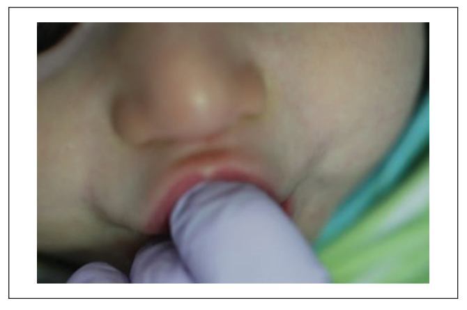
When placing a finger into the oral area, the lip developed a fold between the nose and the edge of the lip, which indicated that the lip was tied to the maxillary mucus, displaying a skin crease.