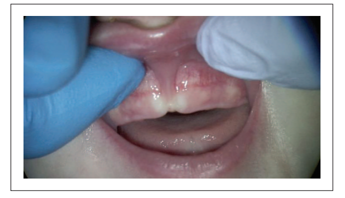
Figure 11. Class IV Lip-tie