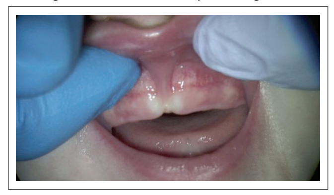
Class III tongue-tie and class III lip-tie, as described by Dr. Kotlow, are shown.

Figure 2. An Infant with Both Lingual- and Upper Lip-ties Presenting for Treatment with a History of Latching Difficulties