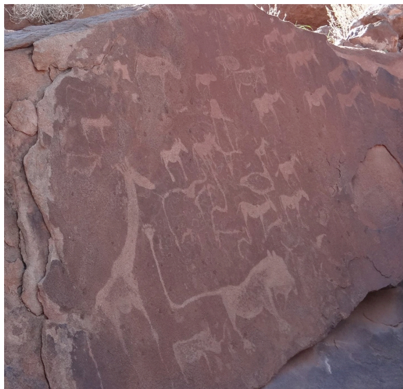
Figure 8. Petroglyph therianthrope consisting of a lion with a human hand emerging from its tail, at the Twyfelfontein UNESCO World Heritage Site, southern Kunene, west Namibia.