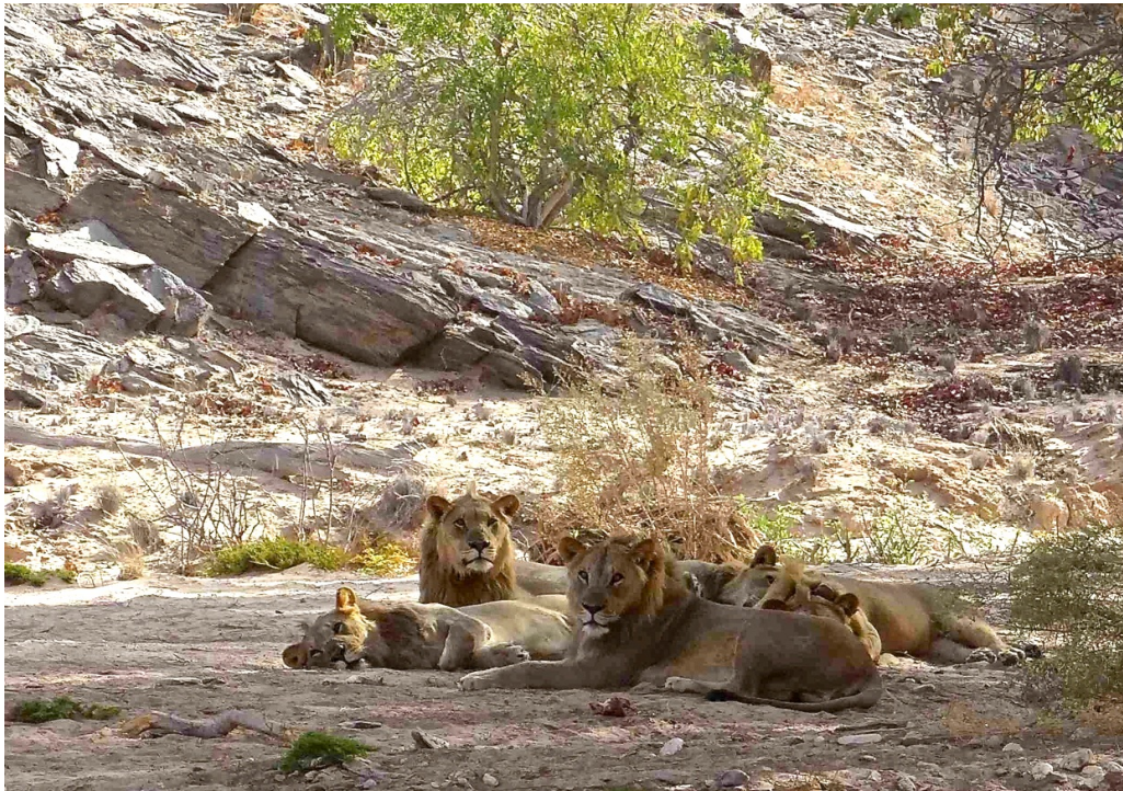
Figure 7. Lions encountered in the ephemeral Hoanib River, close to the former dwelling site of ||Oeb (see Figure 3) and the present Hoanib Skeleton Coast Camp run by the international eco-tourism company Wilderness Safaris 72 . This pride is the group known in Namibia's Desert Lion Conservation project 73 as 'the musketeers'.