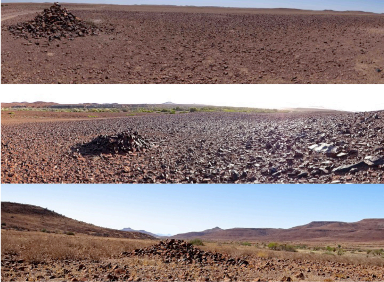
Figure 6. Haiseb cairns / ||ho||hobabs located in the Palmwag tourism concession.