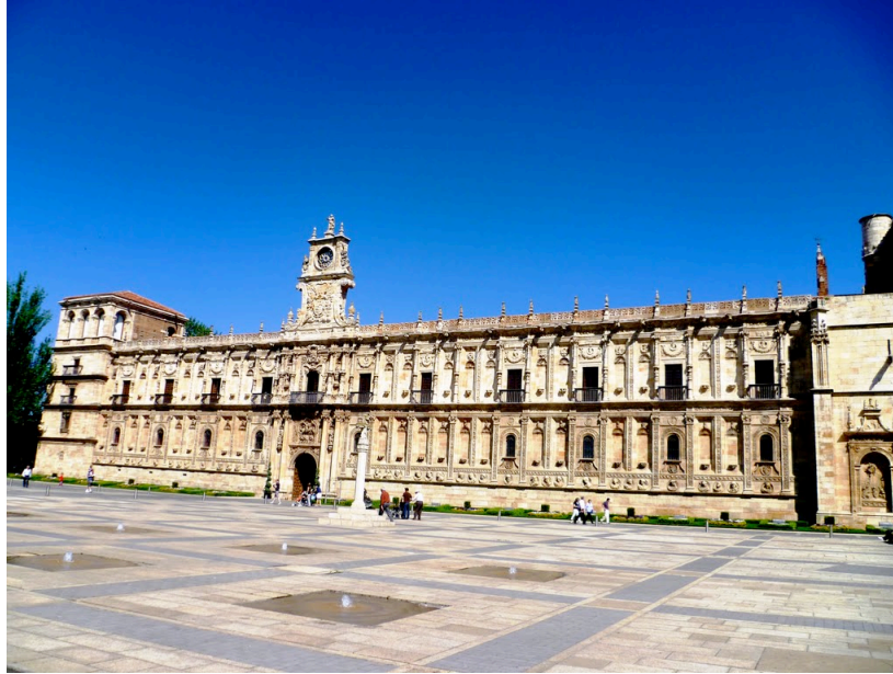
Parador de San Marcos

important collection of 10 th and 12 th century cloths from Asia. The library contains many ancient manuscripts and rare books, including a Book of Job from 951 and a Visigothic Bible. (B)