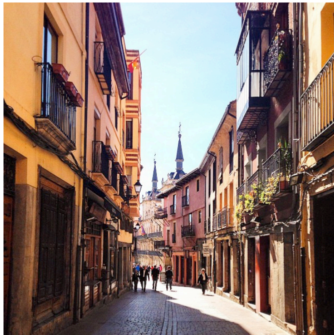
Santo Domingo de la Calzada

After breakfast and check out we will leave Aragon and travel west to Santo Domingo de la Calzada. This town on the road to Santiago de Compostela is named after the 11 th century saint who built bridges and roads (calzadas) to help pilgrims. Miracles performed by the saint are recorded in carvings on his tomb in the cathedral. The most obvious and bizarre record is a cage set in a wall in which, for centuries, a live cock and hen have been kept. Along the way we will stop in Laguardia for our group lunch. Laguardia is a gateway for experiencing the Rioja wine region and it is a good example of a walled village that has not changed much since the 13th century. We will visit one of the bodegas in this wine country of La Rioja. After lunch, we will continue on to Santo Domingo where we will arrive in the late afternoon. (B L)