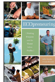
ECOpreneuring (New Society) ecopreneuring.biz