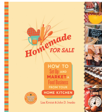
Homemade for Sale (New Society) homemadeforsale.com