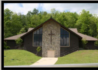
Worship & Activities Center

*Certain restrictions apply to these services/activities