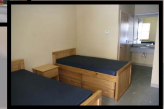
Dale Hollow Room