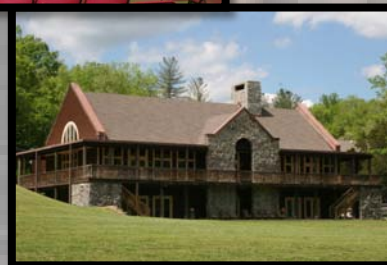
Dining Room & Conference Center