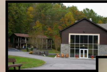
Dale Hollow Lodge

The upstairs lounge area has multiple flat screen TVs and table game area.