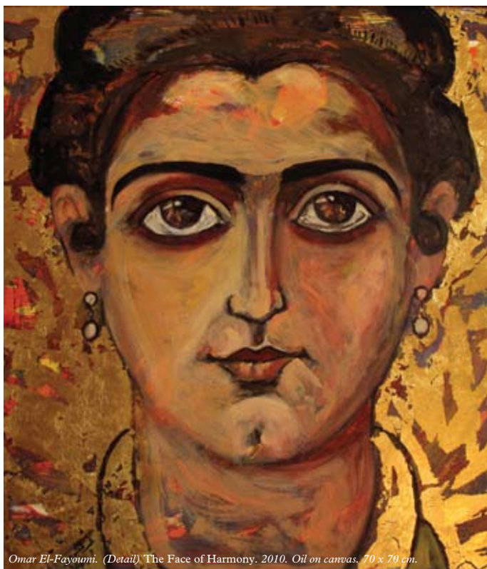
Omar El-Fayoumi. (Detail) The Face of Harmony . 2010. Oil on canvas. 70 x 70 cm.

In one such example, the foreground of American artist Thomas Hartwell's photograph shows a Western wife and husband cuddling in the desert sand as their Egyptian guide, oriented to Mecca, prostrates in prayer behind them. The festival made real that which the photograph represents, the 'shared space' in which mutual understanding and respect can take place in all their complexity. Hanging on the opposite wall was Abla's The Nostalgia of Harmony