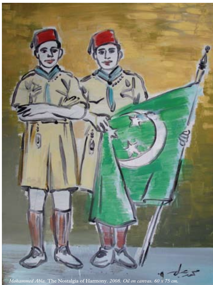
Mohammed Abla. The Nostalgia of Harmony . 2008. Oil on canvas. 60 x 75 cm.

"To experience true harmony between peoples, interaction must be 'face to face'... portrait painting enables the viewer to look into the eyes of the other, which... is needed for harmonious and peaceful living." — Omar El-Fayoumi