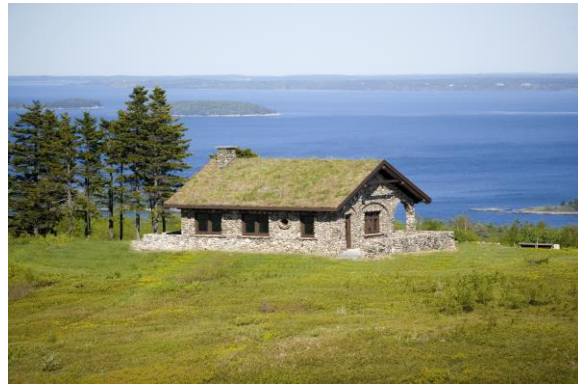
Beech Nut

Or Click on “Become a Member” @ www.coastalmountains.org