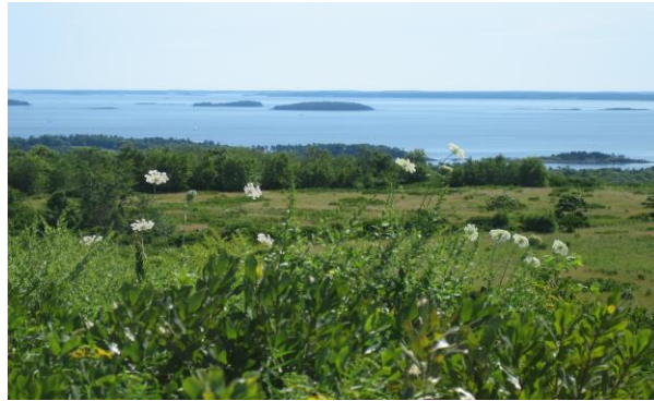
View of Penobscot Bay from Beech Hill

Originally protected by a conservation easement in 1986, the summit of Beech Hill was purchased in 2003 by Coastal Mountains Land Trust with support from Maine Coast Heritage Trust, the Land for Maine's Future program, the MBNA Foundation, and individuals who have long appreciated this dramatic and beautiful property.