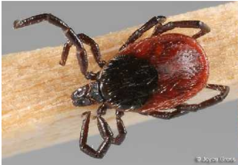
Western Blacklegged Tick (Lyme Disease Vector)