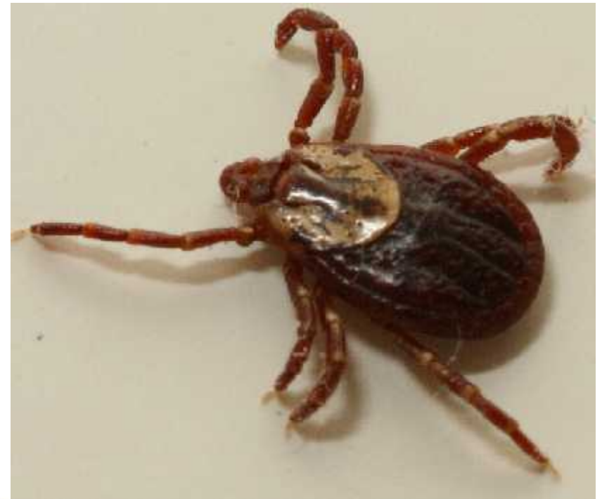
American Dog Tick