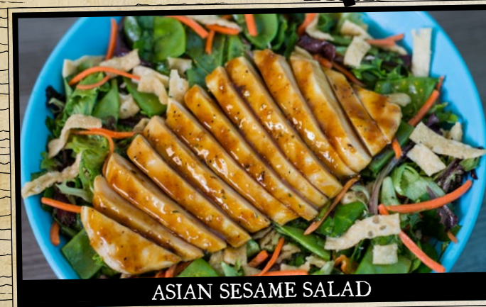
ASIAN SESAME SALAD