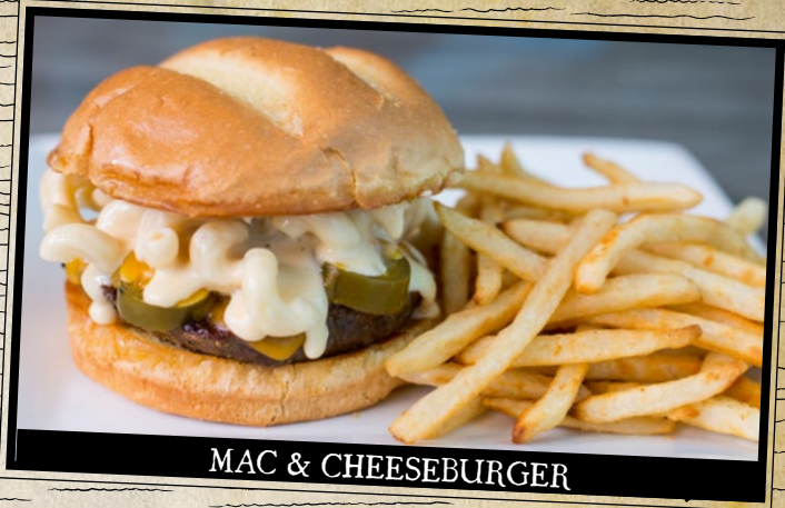
MAC & CHEESEBURGER