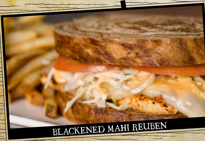
BLACKENED MAHI REUBEN