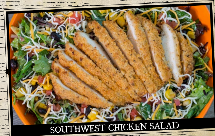
SOUTHWEST CHICKEN SALAD

Grilled shrimp tossed in our Medium Buffalo sauce, then topped with homemade buttermilk ranch dressing and melty colby jack cheese. Shrimpin' made easy. $9.95