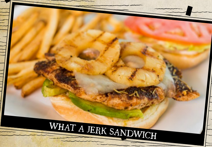
WHAT A JERK SANDWICH

Our delicious take on a reuben sandwich. Featuring a juicy, blackened mahi fillet with crunchy shredded cabbage, cool tomato slices, melted swiss cheese and our special Island sauce on toasted marble rye bread. $11.95