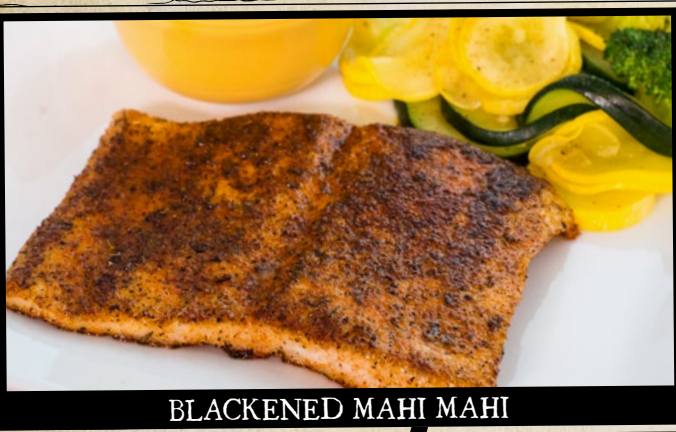
BLACKENED MAHI MAHI

Your choice of chicken, shrimp or double veggies paired with an eclectic mix of snow peas, zucchini, summer squash, carrots and pineapple tossed in our very own kicked-up stir fry sauce. Served alongside a bed of Jasmine Rice. No sides needed for this bad boy. Chicken $12.95 | Shrimp $14.95 | Veggies $11.95