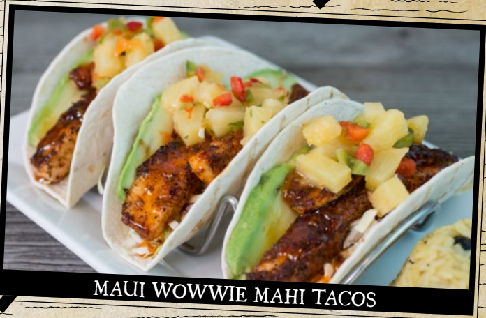
MAUI WOWWIE MAHI TACOS

Our juicy blackened mahi chillaxing with crunchy cabbage, homemade pineapple pico, our awesome Sweet Thai Chili sauce and finished with cool, fresh avocado. $11.95