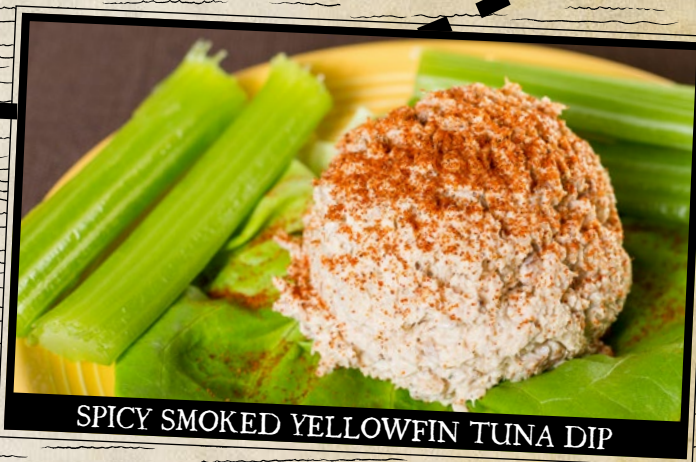
SPICY SMOKED YELLOWFIN TUNA DIP

A new spin on an old classic. We eliminated the fryer and accentuated the flavor. Stringy mozzarella served with zingy marinara. $7.95