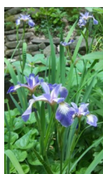
Blue Flag Iris