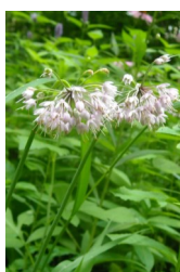
Nodding Pink Onion