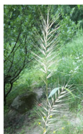
Bottle Brush Grass