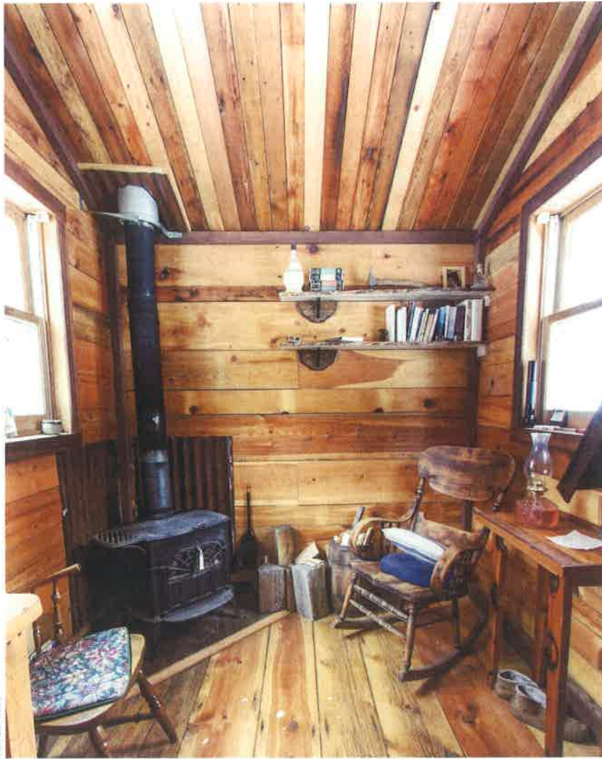
Reducing the impact: reclaimed materials and a woodstove.

in dorm rooms in university didn't bother me, at least the size of the rooms didn't, and that the three years I spent in Japan in my 20s suited me fine, the diminutive size of nearly everything there a nice change. In Japan, I liked the sparseness of the rooms, too—the aesthetic of less. It would color my thinking for years, and continues to do so.