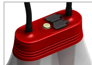
Splash proof electronics