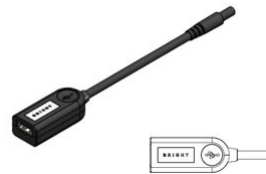
USB phone charging adaptor