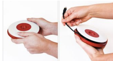
3 meter cable in solar disc