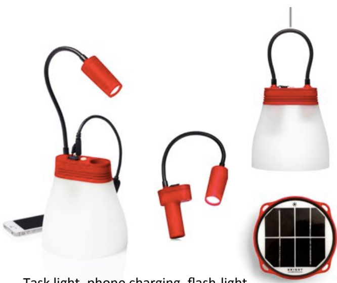
Task light, phone charging, flash-light and ceiling light