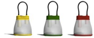
Available in 3 colours

*All specifications may be subject to revisions and change to improve product performance or price/value targets.