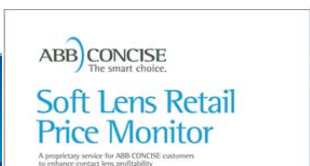
ABB CONCISE The smart choice.