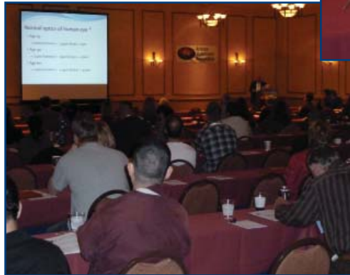
Above: Attendees in general session