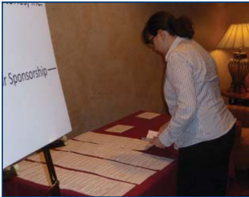
Below: AZCOPT Student Tina Esposito