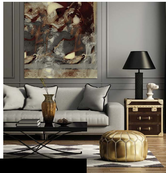
OCHRE MARBLE