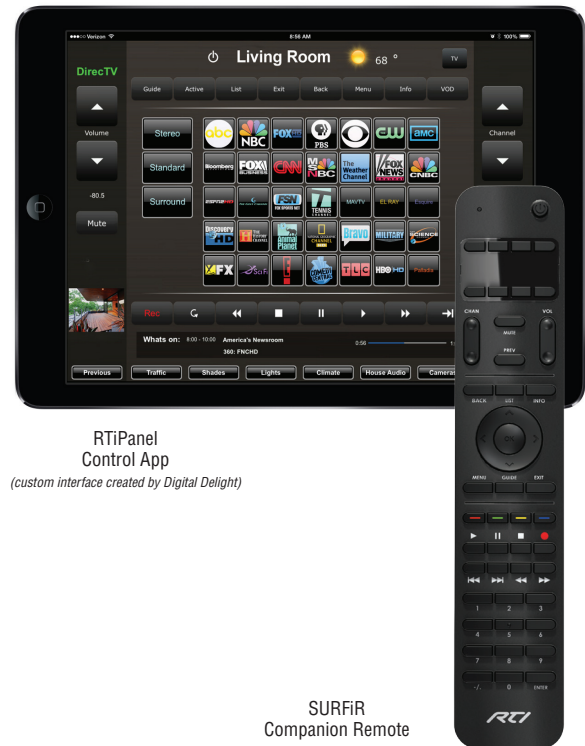
RTiPanel Control App (custom interface created by Digital Delight)

With RTI’s award-winning Integration Designer® programming software, Digital Delight was able to completely customize the RTiPanel user interface to provide the client with a comprehensive home automation system. For example, the client is now able to control the Lutron lighting and shade system, monitor the gate status, and view security camera footage all within the RTiPanel user interface on their iPads. Also incorporated into the custom RTiPanel interface was access to real-time traffic cameras and weather radars, providing the homeowner with quick and easy access to current local conditions. For a seamless control experience, Digital Delight included seven SURFiR companion remotes, which conveniently keep track of the devices being