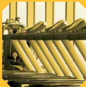
AQUA, INDOOR & OUTDOOR GYMS