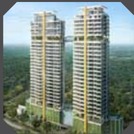
LINCOLN SUITES 2014

KBD is noted for its 'lifestyle-and-theme' developments. Its Starville project was the first to introduce an astronomy-themed residence, complete with a star-gazing observatory. Fiorenza, an avant-garde Italian-inspired architecture, is a 28-unit private development that stands out as an icon of modern living. Fiorenza is the first development to be equipped with a jacuzzi on every balcony, Wifi multiroom digital music system and a motorized sun screen technology in each unit. In April 2006, it announced the acquisition of Hilton Tower, located in the prime freehold Leonie Hill area, for S$79.2 million together with Heaton Land Pte Ltd. It is now the site for the premium condominium, The Lumos. In June 2007, Koh Brothers Group Limited, Heaton Holdings Ltd, KSH Holdings Limited and Lian Beng Group Ltd formed a consortium with equal shares each and were successfully awarded the prime Lincoln Lodge site at 1/3 Kiang Guan Avenue, off Newton Road in District 11. The site has been redeveloped to the luxurious condominium project, Lincoln Suites, which features sky-high elevated gyms, Wifi multiroom music systems and thematic communal dining facilities. KBD continues to push the envelope in redefining urban living and maximizing living comfort with innovative technology in upcoming projects.