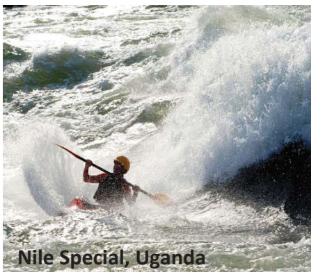
Nile Special, Uganda

I started kayaking at Uni, as my brother had some cool kayaking stories and I wanted to give it a go, I soon became hooked! I spent the next half year swimming down most of Scotland's classic beginner rivers. I hit up the Uni Alps trip in my first year and then headed off to Uganda. Uganda was definitely a turning point for me, as rolling up in the eddy lines around the Nile Special really got my roll up to scratch. Since then I have spent my term times in Scotland heading up the Highlands most weekends, with summer trips to Norway (2011) and the French and Italian Alps (2012). I have been on the EUCC committee for 2 years first as Publicity then as Vice President. Whilst Vice I organised weekend trips for many people -I think the largest was 40, so this has given me experience with planning the logistics of transport, accommodation, food, and the managing of oh so many people on and off the river.