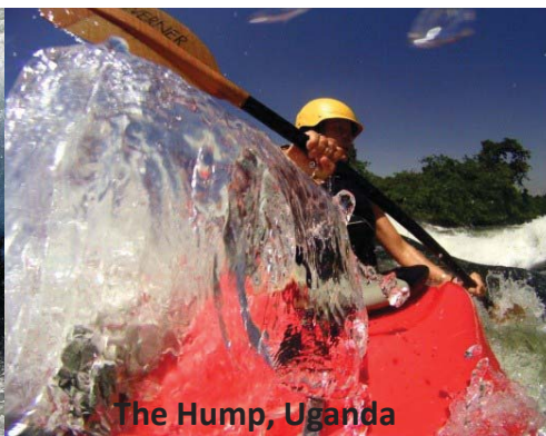
The Hump, Uganda