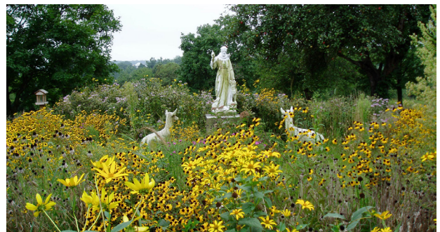
St. Francis in meadows at the Felician Sisters Convent & School, Coraopolis PA

First Place, Excellence in Design, Multi-use Residential, NE Energy Association & AIA Pittsburgh, Green Design Citation Felician Sisters Convent & School Coraopolis PA