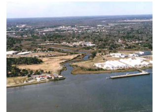
Noisette Creek and the Cooper River