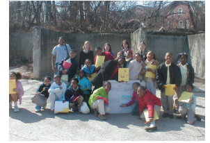
above: On site with the students of Overbrook Environmental Education Center, Phila. PA; left: The Master Plan includes porous paving, rain gardens, flow-through planters and a restored woodland