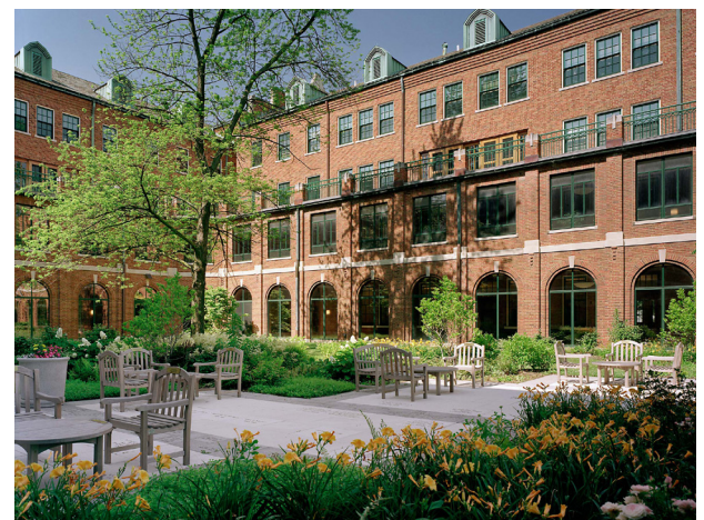
Immaculate Heart of Mary courtyard, Monroe, Michigan