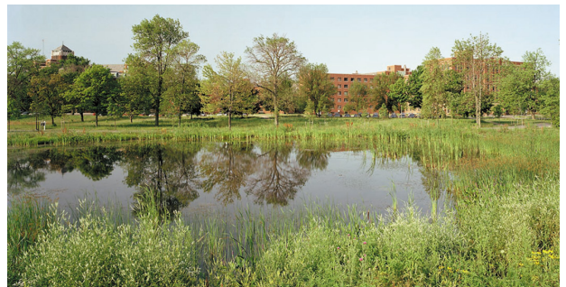
Constructed wetlands at the Immaculate Heart of Mary treat graywater from the facility

Developed a plan to transform a brownfield into an urban oasis. "Most environmental centers are in parks or natural areas. This one will be on a commercial corridor – you can't get more urban than that!"