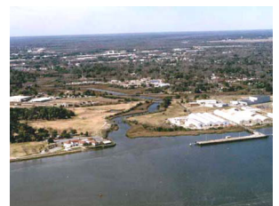
Noisette Creek and the Cooper River