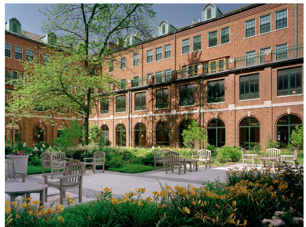
Immaculate Heart of Mary courtyard, Monroe, Michigan