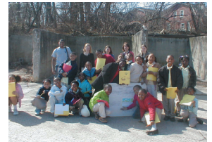
above: On site with the students of Overbrook Environmental Education Center, Phila. PA; left: The Master Plan includes porous paving, rain gardens, flow-through planters and a restored woodland