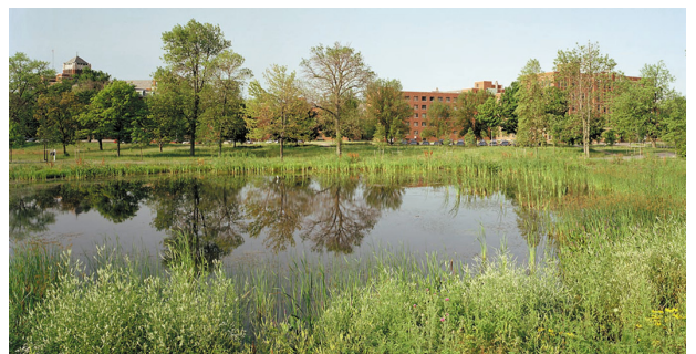
Constructed wetlands at the Immaculate Heart of Mary treat graywater from the facility