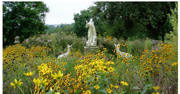
St. Francis in meadows at the Felician Sisters Convent & School, Coraopolis PA