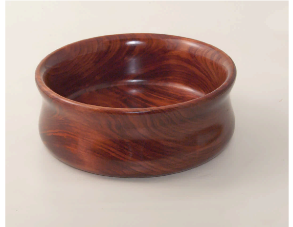
Tom Nehl-Cherry-tinted & dyed-poly- POM