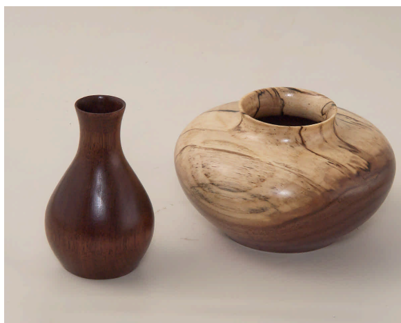
Terry Galvin-walnut bowl-mahogany small vase-poly-POM