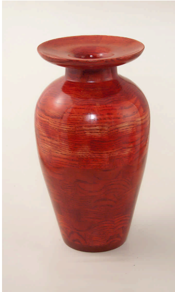
Harvey Jeck-Oak-dye& poly- POM