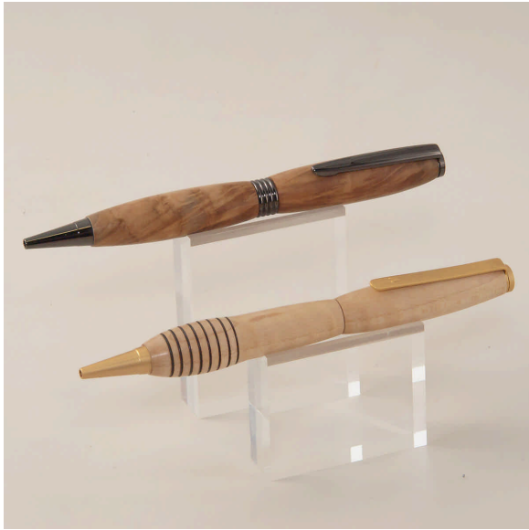
Tim Matveyuk-figured oak & maple-CA-POM