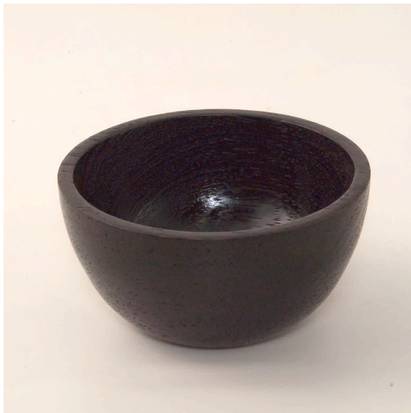
Tim Matveyuk-Wenge-spray varnish- POM