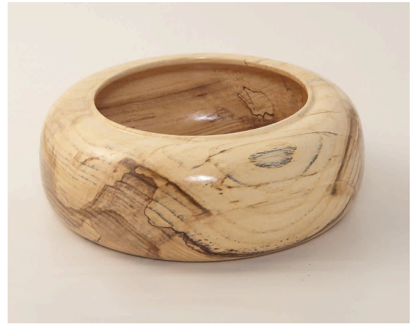
Tom Nehl-Hackberry-poly- POM