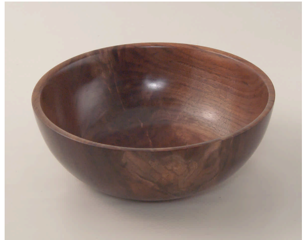
Kevin Bierman-walnut-Antique oil-POM