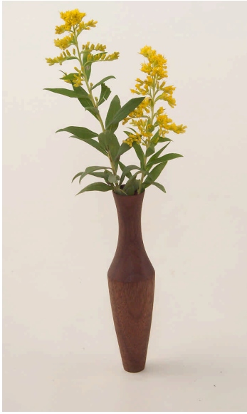
Bruce Kruse-walnut- Boiled linseed oil- POM