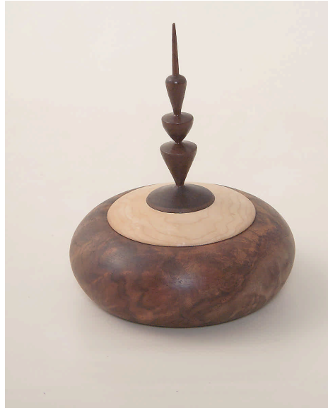
Wayne, Hofer-walnut and ma- ple –wop- POM