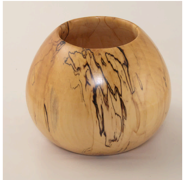
Terry Galvin-soft maple-poly-POM