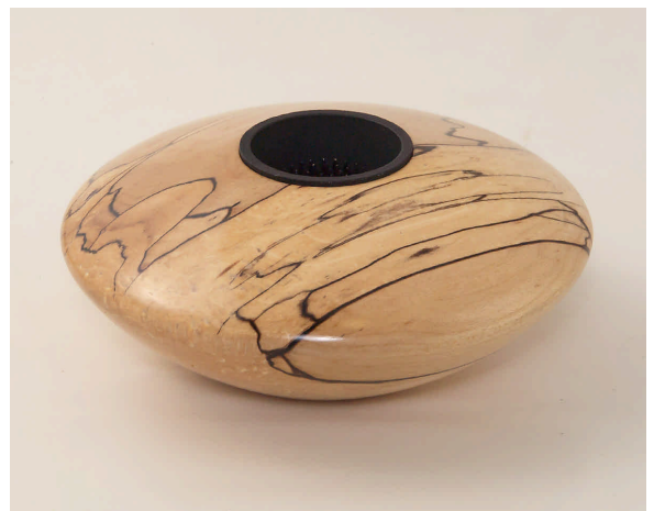
Greg Ellyson-spalted maple -lacquer- POM