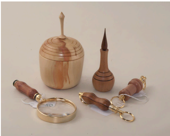
Jordan Ferr-Japele key ring-Boxelder lidded box-naple and walnut ring holder-bubinga magnifying glass-pink dogwood key rings-WOP-POM