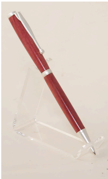
Stacy Nehl-pink ivory-CA- POM