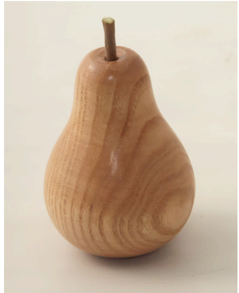
Jim Bodin-Honey locust-buff & wax-POM