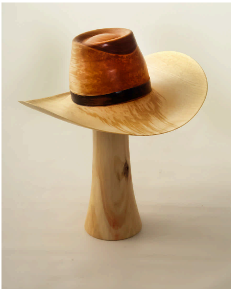
Greg Ellyson-Birch-Wipe on poly-S&T