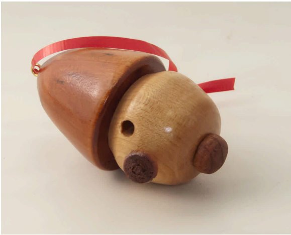
Byron Bohnen-Maple & Walnut-S&T